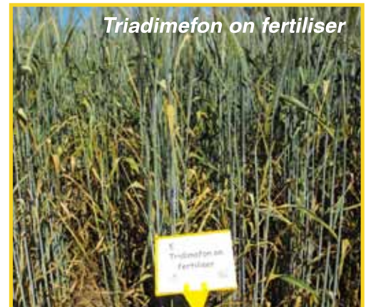
Triadimefon on fertiliser

If people prefer to treat their fertiliser with liquid Flutriafol (similar to Impact®) we have great prices on that too.